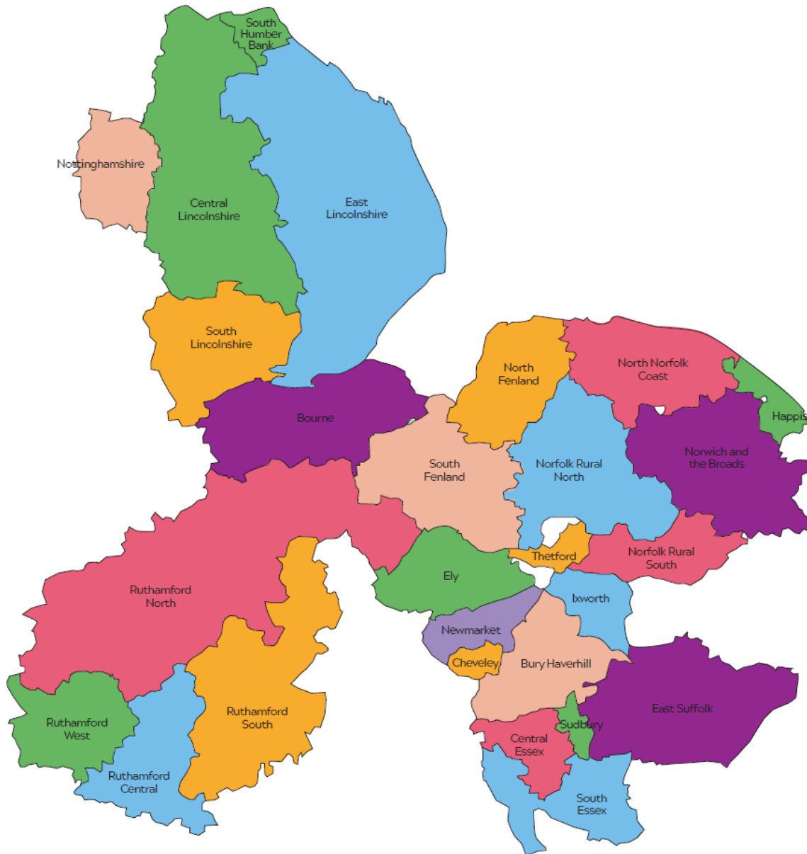
Figure 2: WRZs in the WRMP